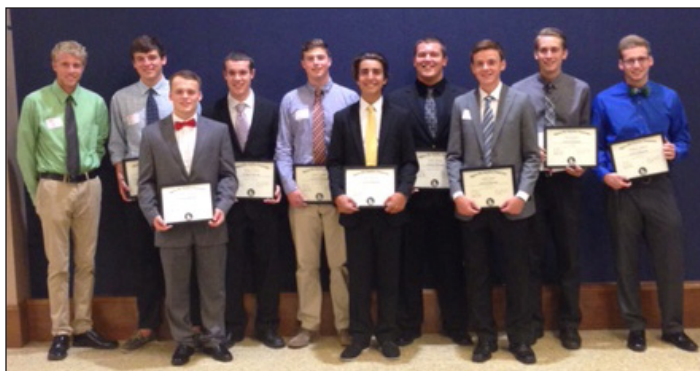
Balanced Man Scholarship recipients.