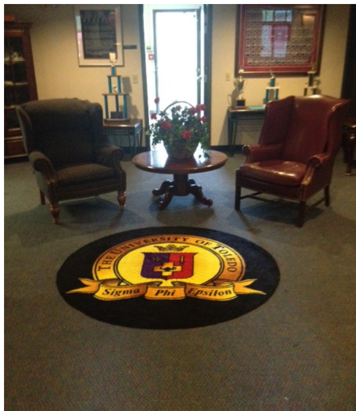
A new custom rug welcomes guests into the chapter house.