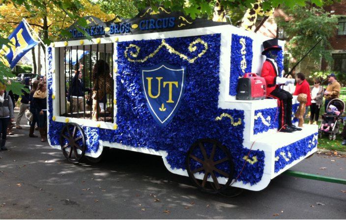
Sig Ep's award-winning Homecoming float.