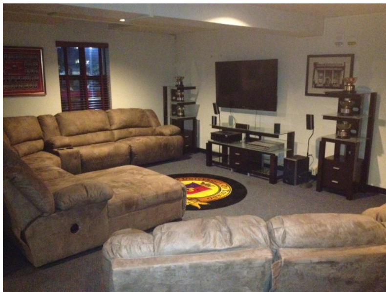
Housing improvements include new furniture, TV, trophy cases, and carpeting in the living room.