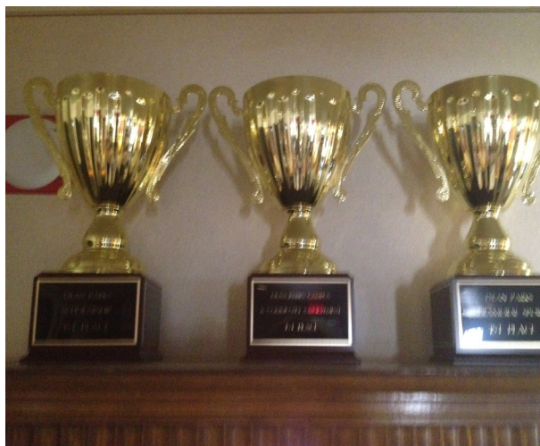
The chapter swept all three Dean Parks Awards for grades, sports, and campus and community involvement.

Ohio Iota has made a lasting impact on all of us, and we take pride in carrying on traditions and standards set forth by our alumni. This year, the current members of Ohio Iota look forward to carrying SigEp to even greater heights as we look to improve on our values of Virtue, Diligence, and Brotherly Love each and every day. We ask that you look for us around campus and around the Toledo community, and feel free to come check out the campus house. Remember, the Red Door is always open, and a Brother is always welcome. Thank you for your unconditional support, and we hope 2013 is your best year yet.