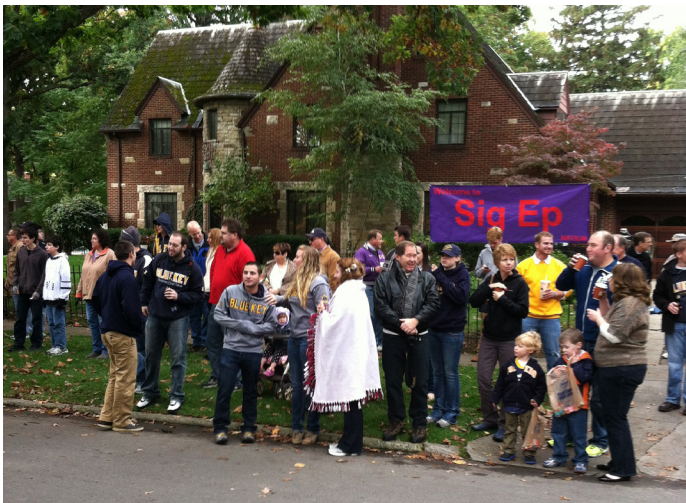
Brothers and guests awaiting the Homecoming float.