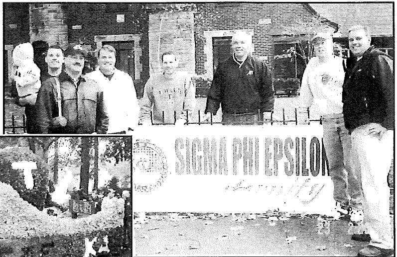
Ohio Iota Alumni Gather for the annual Parade Viewing Party / The Sig Ep and Kappa Delta Float

After the parade, the annual cookout was held at the house for alumni and parents of undergraduates. The game was a